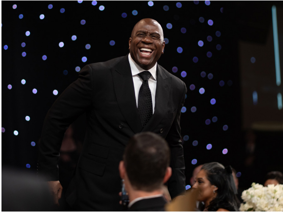
Magic Johnson delivered an inspiring speech and made the evening even more special by posing for photos with guests. A true highlight of the night!