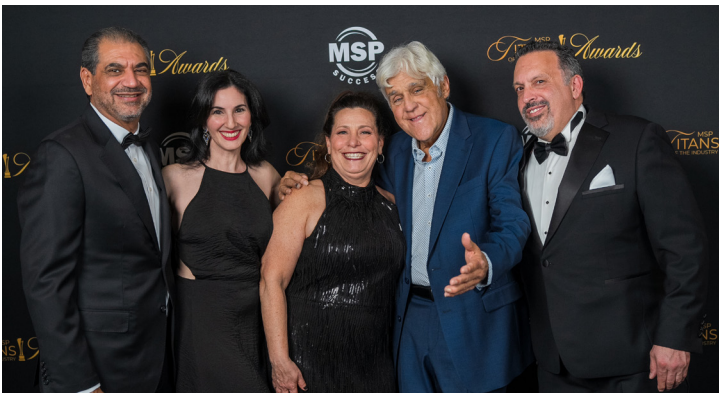
Star-studded moments: Guests had the honor of posing with the legendary comedian Jay Leno, adding a touch of humor and charm to an extraordinary evening.