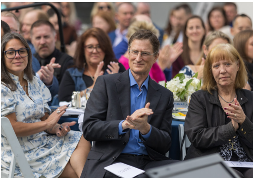
As we gathered to celebrate excellence, the Awards Brunch provided the perfect setting to honor and applaud our industry leaders for their achievements and dedication.