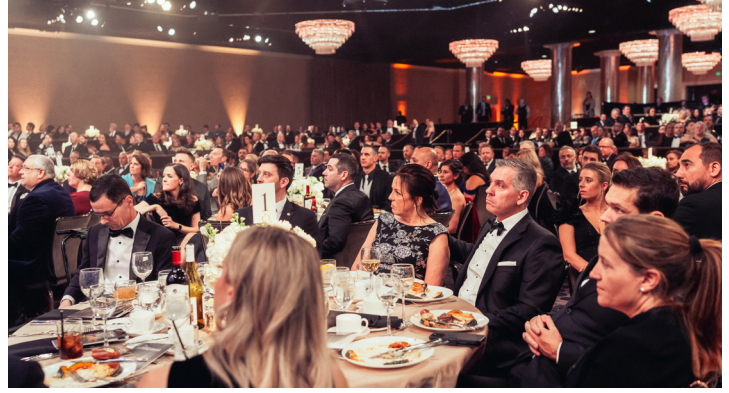
Hundreds of MSPs gathered in style to celebrate the industry's success, dressed to impress and honoring the leaders driving innovation and growth. It was definitely a night to remember!