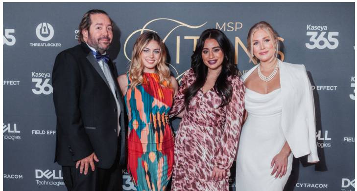
Red carpet moments that shine bright! Striking a pose, sharing smiles, and kicking off an unforgettable evening of celebration.