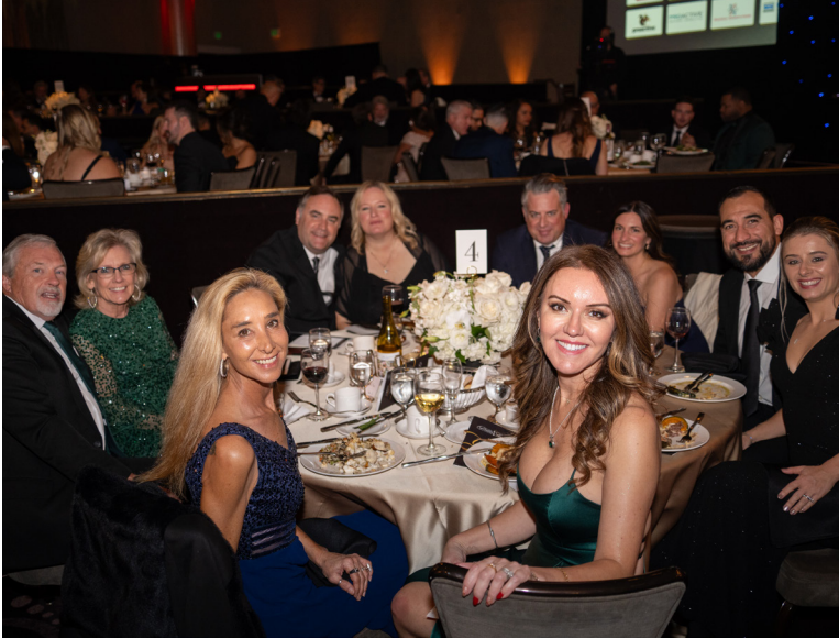
An evening of elegance, laughter, and celebration—memories made at the gala with great company and timeless style.