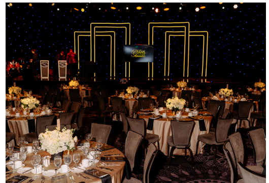
A stunning gala awards room bathed in elegant lighting, with round tables adorned with white floral centerpieces and flickering candles creating an atmosphere of sophistication and celebration.