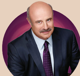
Dr. Phil McGraw