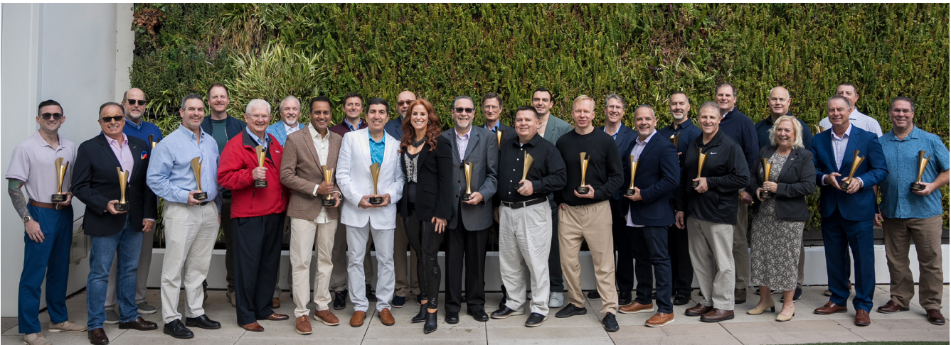
Our incredible Titans Award winners stand together, embodying leadership, innovation, and success. Congratulations to these industry titans!