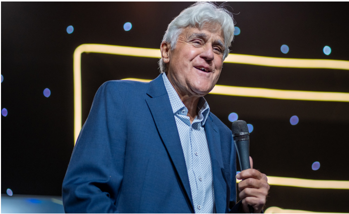
Jay Leno's speech brought endless smiles and entertainment, leaving the audience in stitches and creating unforgettable memories.