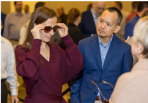
Elegance in every detail: The Kaseya-sponsored gifting station featured a stunning selection of designer sunglasses, offering guests a touch of luxury to remember the evening.